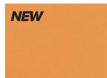
JAFFA RAL 2003 *MOQ 20

Clear lacquer, BioCote antimicrobial coating not included.