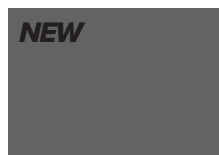
GRAPHITE - TEXTURE GAK-MW333E