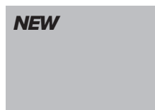
CLEAR LACQUER FINISH