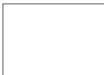
WHITE RAL 9003 GAK-MA585E