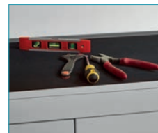
Dished top available on half height cupboard.