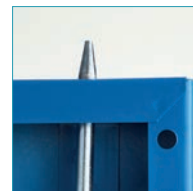
Three point locking for secure storage.