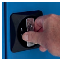
Handle is designed for easier operation; allowing the door to close without the key.

All painted components are protected with a powder coating which incorporates ActiveCoat anti-bacterial technology.